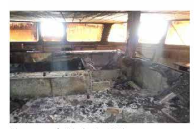
Damage on the Navigation Bridge