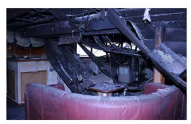
Fire occurred in the Bridge ceiling/void

Damage to Bridge and partially to Accommodation. The fire started within the wheelhouse ceiling void space in an electrical connection box with a circuit board installed on a plywood board inside of the ceiling.