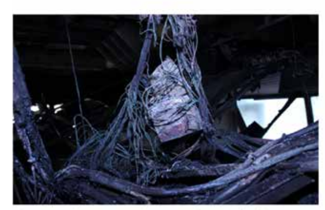
Damaged wiring and circuit board which was fitted to the plywood board.