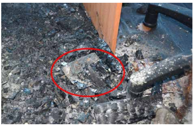
The PCB (circuit board) lying amongst debris on the floor

Norwegian Hull Club wishes you all fair winds and following seas.