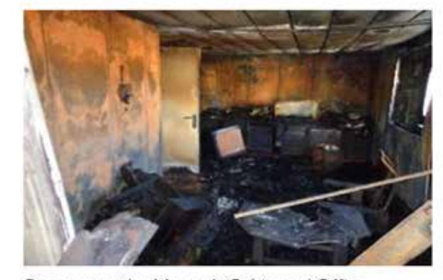
Damage to the Master's Cabin and Office