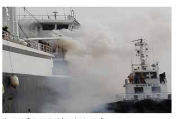
A port fire patrol boat at work

The fire started in the vessel's gymnasium; however, the cause of fire could not be concluded.