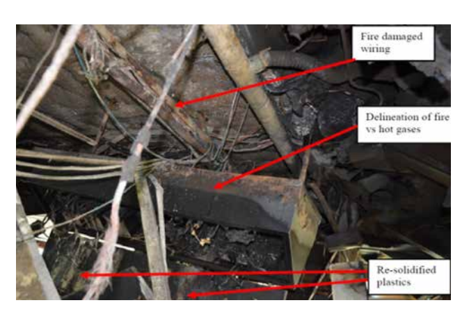
Where the fire started